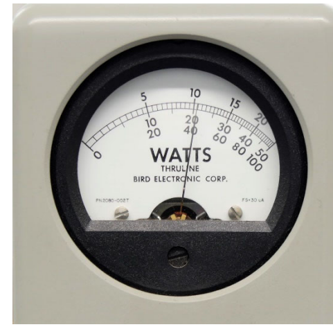
Cable length: 40 cm