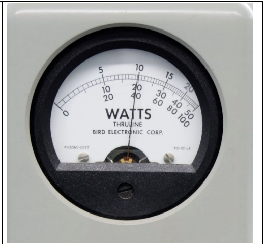
Cable length: 10 cm