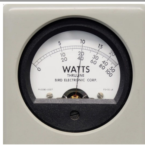
RF power is set at 10 W.